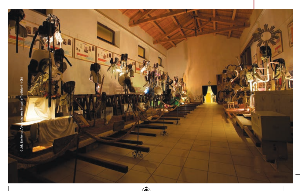
On this page: The contraption hall dedicated to Cosmo Teberino, where one can observe up close and in detail each contraption, support structure and also the costumes and objects used by the children and adults for each scene.

to contain the generous monetary offers made by the crowd during the procession. On the walls of the museum, there are photos and giant pictures depicting the event. The procession of St. Peter's Square in Rome in 1999 and the one in Assisi in 1991 and 2011 are considered immortal, in the middle of two wings of crowds celebrating in awe.