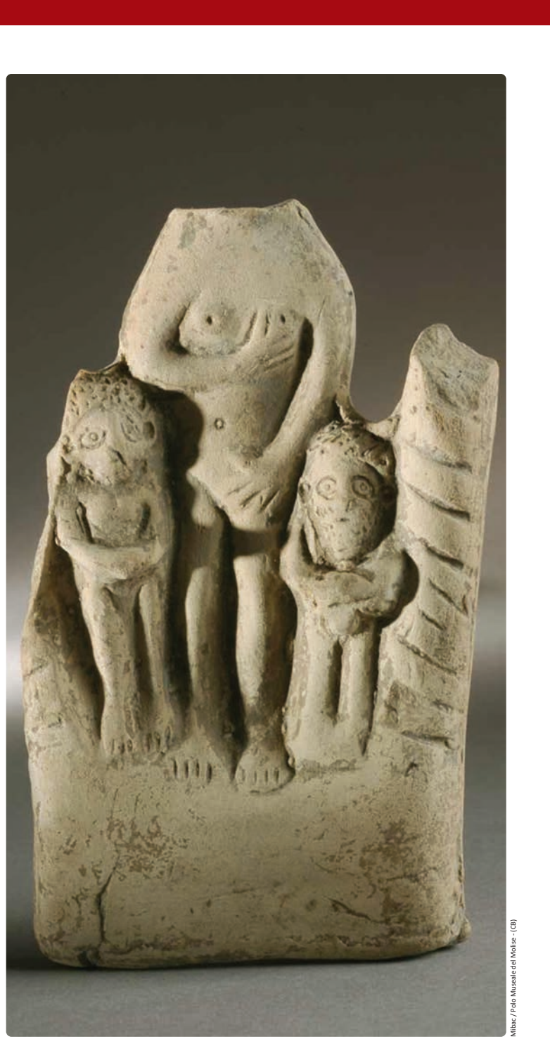
Clay of Venus between two figures of Priapo framed by Tortile balusters.