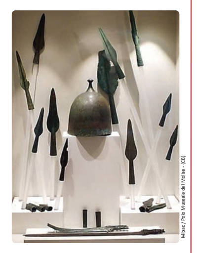
On pag. 18: Mazzarotta Palace, access door to the Samnite museum in via Chiarizia. Above: Display showcases with helmets and lance tips from the pre-Samnite. Below: Equestrian statue, ornaments for the attire of Samnite women and amber jewels of the Iron Age.

The itinerary begins with the showcase containing a selection of male and female funeral attire from the Iron Age: here the ceramic materials of dauna origin or the large bronze receptacles of Etruscan tradition, demonstrate the external cultural influences that contributed to the formation of the Samnites. However, the material testimonies of the presamnite communities date back from the Bronze Age, when the first complex societies were consolidating: from the storage of ancient bronze axes in Vinchiaturo, to the reproduction of the interior of a hut of the Fortified village of Campomarino, to an example of armament of a warrior of the final Bronze Age. The male burials that followed of VII-V century B.C. confirm the existence of a warrior aristocracy.